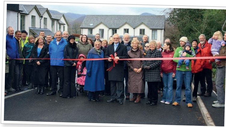
Opening of a Community Land Trust Housing Scheme.